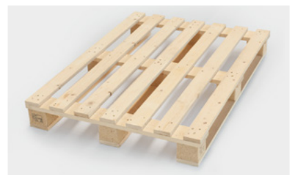
Pallets & packaging solutions