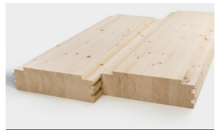
Glued ceiling systems