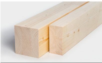
Glued solid timber Duo/Trio