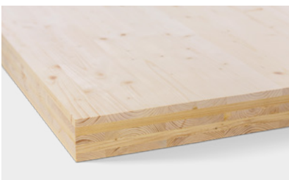
Cross laminated timber