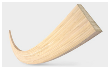
Glued laminated timber – special components