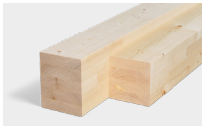
Glued laminated timber