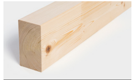
Structural finger jointed solid timber & GLT®